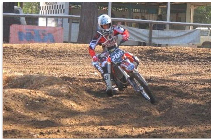
Northern NSW Challenge Final Round Maclean 7 Aug 2011